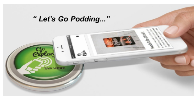
" Let's Go Podding..."

The vast distribution of Map Pods, covering the Lake District and the Yorkshire Dales will be popular to the millions of visitors to these regions and a boon to those businesses wanting to access these visitors.