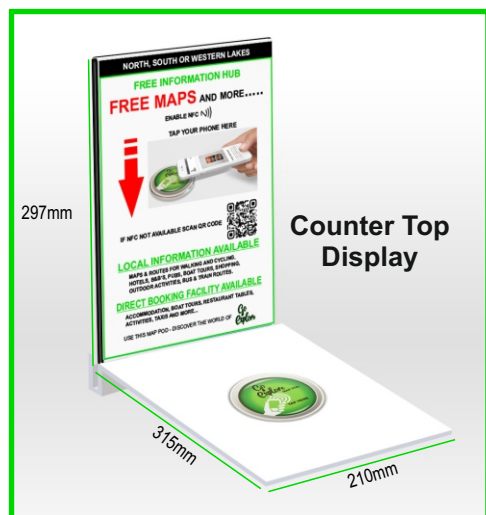
Counter Top Display